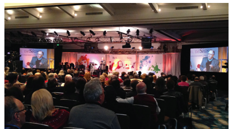
Attendees at the Ministries Convention in Monterey

On January 14, 2014 the North American Division held its Ministries Convention. Over 500 attendees from the NAD territory were blessed by many seminars and workshops. Conference Presidents, Pastors, Union and Division administrators joined the Union and Conference Health Ministries directors who attended the Adventists Recovery Ministries (ARMin) workshop. “This is needed not only for the community, but for our members, pastors and leaders” said a Conference administrator. All concurred. Future Training sessions are being planned for California and Canada.