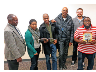
Andrews University Counseling Class attend ARMin lecture

Graduate and seminary students in Pastoral Counseling and Marriage and Family classes at Andrews