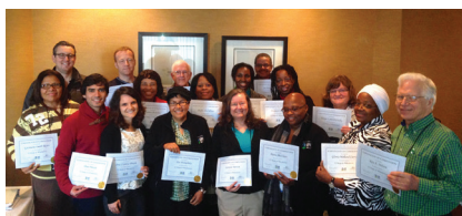
Attendees at the ARMin Training – Health Summit, Orlando, Florida